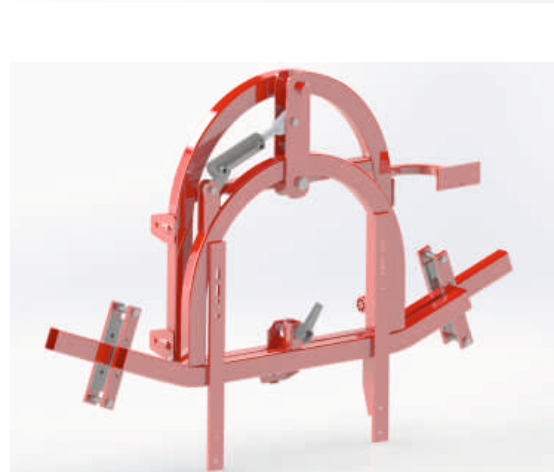
Self-leveling for manually unfolded booms.

The self-leveling ensures proper operation of the spray boom, keeping constant spacing over protected plants.