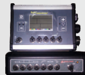
Tee Jet 844E

For correct functioning of the sprayer, we recommend three control groups.