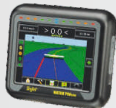
NAVIGATION MATRIX PRO 570