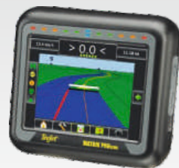
NAVIGATION MATRIX PRO 570