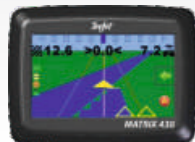
NAVIGATION MATRIX 430