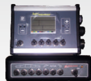
Tee Jet 844E

For correct functioning of the sprayer, we recommend three control groups.